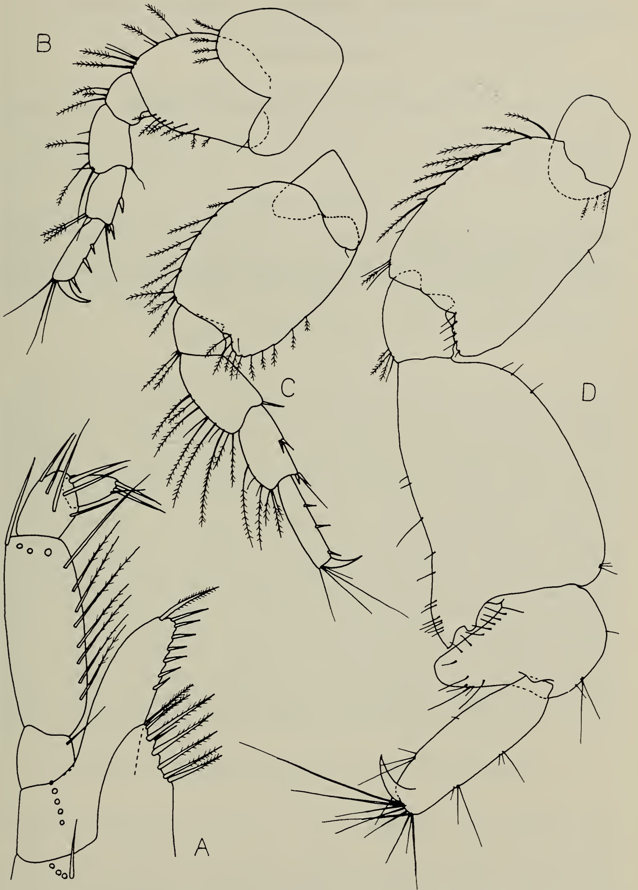
Fig. 5. Stenocorophium bowmani : A, Maxilliped; B, Pereopod 5; C, Pereopod 6; D, Pereopod 7.